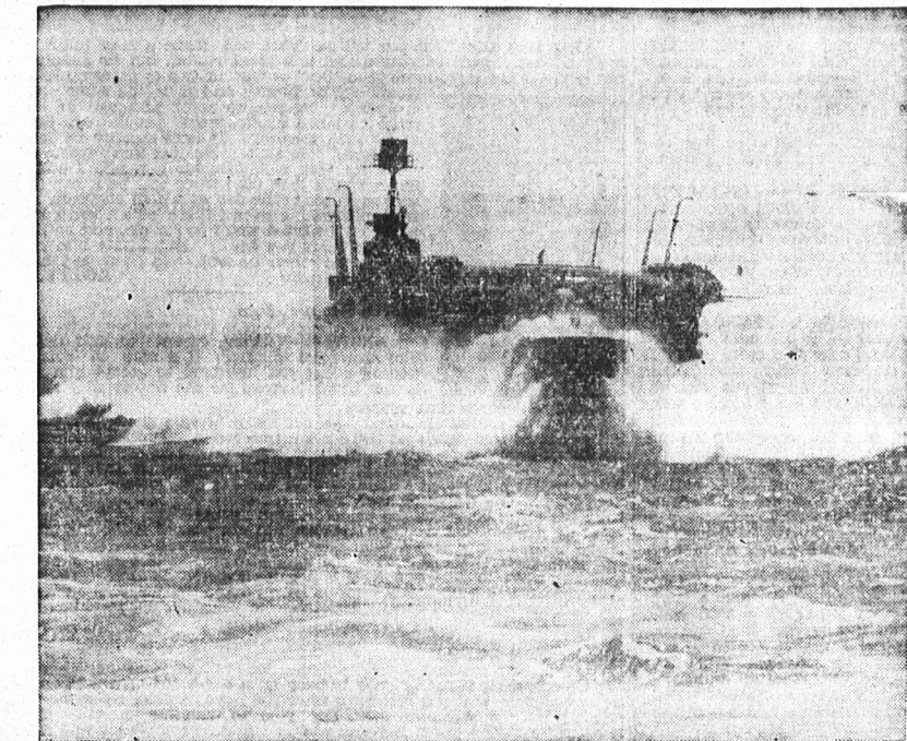
"FURIOUS" LOOKS FURIOUS—Like a snorting sea monster, almost hidden by the spray and foam as she ploughs through rough seas, Britain's aircraft carrier H.M.S. Furious carries out her assignment in grim earnestness on submarine patrol somewhere at sea.

Everybody appeared to be taking part, and with enthusiasm, in the drive for old metal to be given the government and turned into airplanes, tank and battleship parts, and other weapons. Unions in Tacoma, Wash., built a huge collection bin in the middle of the city's busiest street intersection. Chorus girls in New York city turned out to help Boy Scouts, firemen, police, and members of civic organizations who, in the metropolises as elsewhere were gathering the donations.