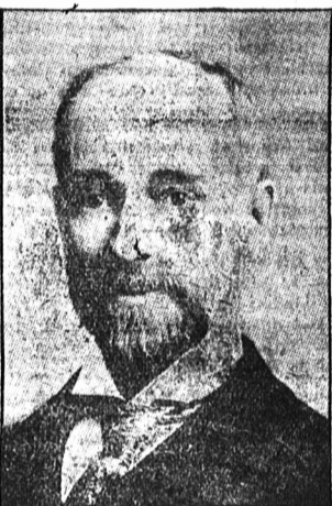
MAYOR URQUHART Liberals, defeated by Hon. George E. Foster in North Toronto.