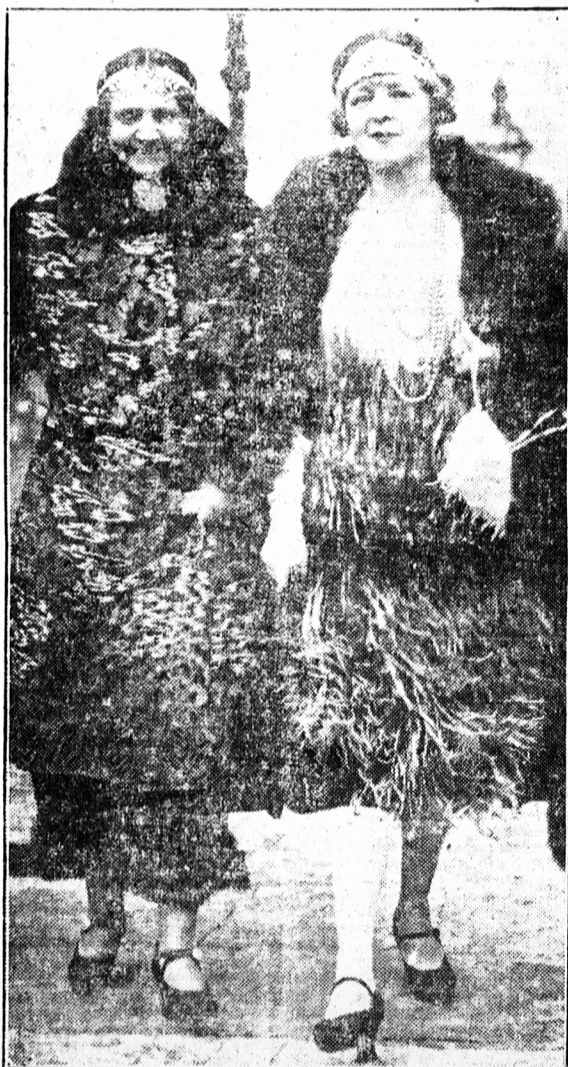
CANADA WILL SOON WELCOME HER