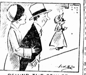
BEHIND THE STYLES

"If there's a cure for spring fever it's a hard one I'll bet." "Right—it's hard work."