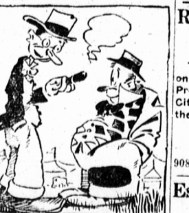
GOT A KICK SURE

Disconsolate Wooden Soldier: How can a fellow "end it all" when he won't sink?