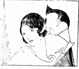
EYES THAT SEE NOT

Does Belle go with that fat Brown? She: Yes. Does she see he's a rouser? She: Of course she sees he's a rouser, she's got eyes. Me: Still I don't think she sees a rouser when he's around, or even if she has eyes.