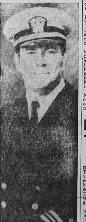
It's sailor Gene now, for the handsome naval officer, above is no other than Gene Tunney, retired undefeated heavyweight champ, uniformed as a Lieutenant Commander in the U. S. Navy. He recently began active service as athletic officer at the naval air station at Pensacola, Fla., and will also serve the Jacksonville and

LONDON, Jan. 15.—(CP)—Vice-Admiral Sir Andrew Cunningham, commander-in-chief of the British Mediterranean fleet, and Vice-Admiral Sir Max Horton, head of the British submarine service, have been promoted to the rank of Admiral, the Admiralty announced tonight. Cunningham had been an acting admiral. Admiral Cunningham, born in 1888, entered the navy in 1908 and received the Distinguished Service Order with two bars in the first great war. He was naval aide-de-camp to the late King George V, in 1922, and later was assigned as Rear Admiral to command the destroyer flotilla with the Mediterranean fleet. He was promoted to vice-admiral commanding the cruiser squadron in 1937 and in 1939 was put in command of the Mediterranean fleet. Admiral Horton entered the navy in 1900 and was a submarine commander in the first great war. He commanded the German light cruiser Sela at Heligoland and the German cruiser Prinz Adalbert in the Baltic as well as three German destroyers and several merchant ships. For his service he was rewarded with the D.S.O. and two bars. He was made a vice-admiral in 1936. Both men were knighted in 1939.