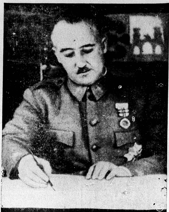
Spain's Franco makes plans, but they don't help Germany's Hitler.