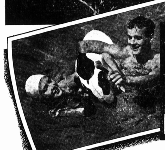
"Remember that day" - Who could forget it!