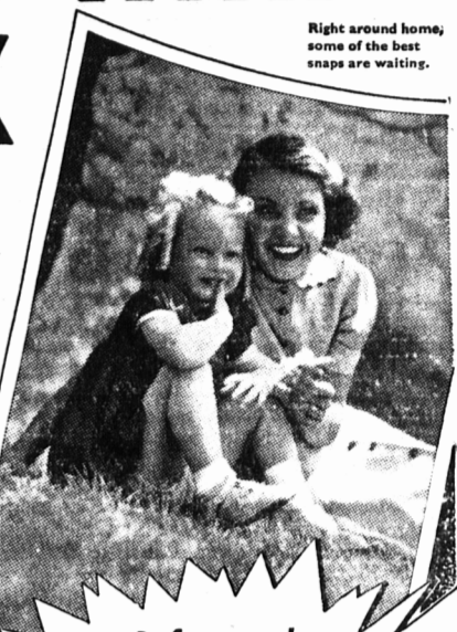
Right around home, some of the best snaps are waiting.

In Canada KODAK is the registered trade mark and sole property of Canadian Kodak Co., Limited, Toronto, Ontario.