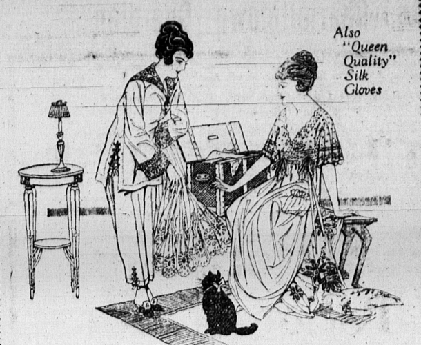
Also "Queen Quality" Silk Gloves

Annual sweet clover, a variety not known previous to last year, has been grown at the Iowa State College. This plant, at three and a half months from seeding, made a growth of four and a half feet in height, producing a heavy crop of seed as well as foliage. This novelty was discovered by H. D. Hughes, of the Iowa Agricultural Experimental Station, who saved the few plants growing in one of 500 plots planted with seed from as many different sources. Planted this year, the seed was found to produce uniformly, making very rapid growth and producing a seed crop in a few months. The chief possibility of the new variety of clover lies in its apparent great value as a green manure crop as its growth in the first year is double as strong as that of the common biennial white sweet clover.