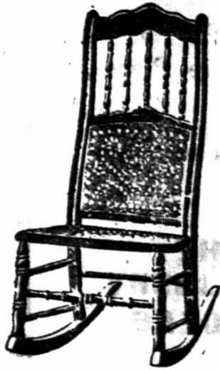
THE EMPTY CHAIR.

You will remember no doubt that President McKinley was shot in the Temple of Music at the Pan American exhibition last September. Think of the 333 chosen for so dark a deed. In the temple of Music. Oh, what discord, what broken harmony. Father and I sat together in this Temple of Music last summer. We heard the strains of the great organ there and rested ourselves awhile. This Xmas we shall miss all that is mortal of father beside us here, but we live in hope of meeting him in the Temple of Music above, a Temple not made with hands Eternal in the Heavens.