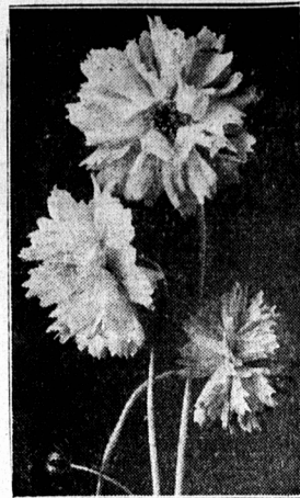
Double coreopsis is easily grown from seed sown early.

There is no garden operation which saves money faster than growing one's own perennials. When plants are purchased they are relatively expensive because of the long growing period, the intensive care they have had and the large percentage of loss. Plants have never been grown successfully in large scale operations because of the limited area over which they can be distributed satisfactorily and the high cost of packing such fragile subjects for shipment. The gardener who grows his own pays only for the seed. The task of caring for the plants and observing their growth is a fascinating recreation, if he is a true garden fan. Among the perennials with which beginners will have little difficulty are columbines, dianthus, delphiniums, gailardias, coreopsis, hollyhocks, pyrethrums, sweet williams, veronica, spicata and violas. Gardeners who plan to grow perennials from seed this year, and every gardener should plan to do so, will have an easier time of it if they will sow in April instead of waiting until June or later. When summers are hot and dry it is often quite a task to get seeds to germinate in June, and seedling plants must be given extra attention at that time to keep from being scorched to death. In April and May, however, we usually have cool, moist weather which hastens germination and is favorable to the young plants. Many