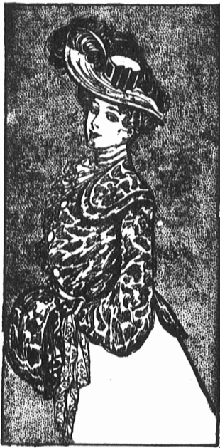
COAT OF BABY LAMB.

ONE of the severest electrical storms that has visited this part of the province for some years, and certainly the worst ever experienced here at this season of the year, occurred Thursday evening accompanied by a strong gale and quite a heavy downpour of rain. Slight flashes of lightning were visible shortly before eight o'clock, but the real storm set in about 8:30 when the lightning became extremely vivid and the thunder pealed forth at times louder than is usually heard here. Many buildings shook when some of the explosions took place, and some citizens who were in the streets during the worst part of the storm were for a few seconds dazed from the shock. The lightning struck the spire of St. Paul's R. C. Church near the top and ran down in snake-like course stripping the shingles about one foot in width down to the brick work, and also damaging some of the eave flashings. The lightning gradually ceased shortly before eleven o'clock, and about midnight the wind veered around to the westward followed by the dropping of the temperature considerably below freezing.