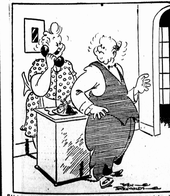
"Alvir and I think it is a splendid idea, mother, you go right ahead and sell your house with a Guardian Want Ad - and move in with us!"