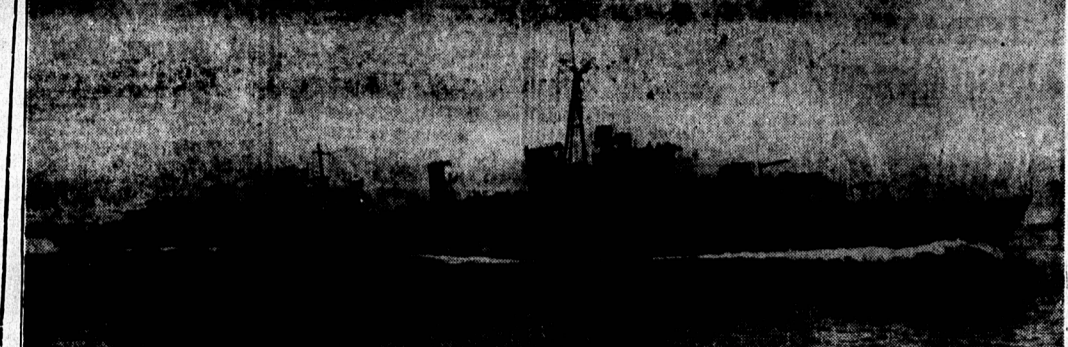
H. M. C. S. "HAIDA" COMMISSIONING: Canada's Fourth British built Tribal destroyer was recently commissioned and is now operating at sea in company with two of her sister ships and units of the Allied navies. She is H. M. C. S. HAIDA and her Commanding officer is Commander Harry DeWolf, R. C. N., of Bedford, Nova Scotia. HAIDA is equipped with all the latest armament and detection contrivances.

50% More Pulls than before at the same low price! The new War-time Economy Package is the same low price 500 tissues (150 pulls) as the old 200 tissue package (100 pulls). If you continue to use the same number of applications of Kleenex as always, you'll find the new War-time Economy Size Kleenex lasts half as long again! And there will be more available for everybody.