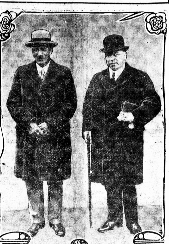
Above are shown left, Hon. Robert Forke, the new minister of immigration and colonization, and right Hon. William L. Mackenzie King, snapped by the camera man in front of the parliament buildings at Ottawa, as they left, following the conference at which the cabinet of the new government was sworn in.