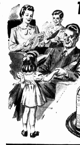
This Happy Family uses ENO'S "FRUIT SALT"