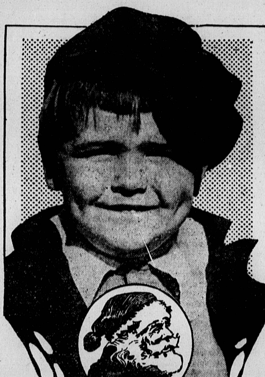
Guardian readers can do their bit to give this little fellow a merry Christmas. A few toys, some candy and fruit. Be a Santa-Pal.