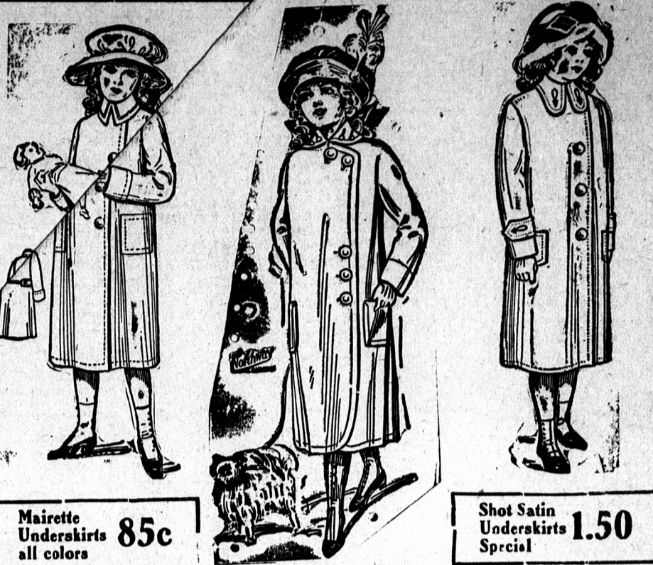
Mairette Underskirts 85c all colors