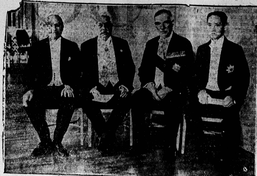
DISTINGUISHED VISITORS AT FRIENDSHIP DINNER

LEFT TO RIGHT: Andre Citroen, the "Henry Ford of France," Ex-Premier Vittorio Orlando, of Italy, the head of the Italian delegation to the peace conference at Paris; Field Marshal Sir William Robertson, formerly chief of the British Imperial general staff; and the Hon. Yukio Ozaki, noted Japanese statesman and member of the Diet since its inception, photographed at the friendship dinner in honor of those who have "negotiated or advanced peace." The function was given in New York city.