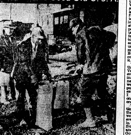
Top photo, showing a Parisian carefully filling a suitcase with his month's supply of coal aroused sympathy for the poor, coalless people of Paris. But folk in Albany, N. Y., are not much better off, judging by lower photo, which shows residents, caught short on fuel due to freight tie-ups, filling paper sacks as they scrape coal dealer's pile to the ground.