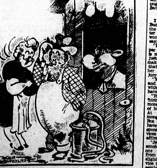
"With the milking machine broken—you'll have to find someone with a Guardian Want Ad that remembers how to milk a cow!"