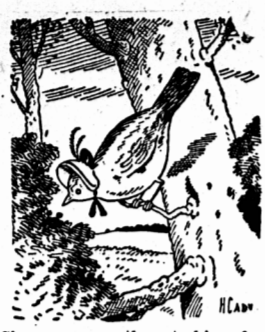
She was even then looking for a nest in which to leave an egg

After the Battle of Britain in 1940, when the R. A. F. defeated the German Luftwaffe, the United States rushed the reserve weapons of the American Army to Britain.