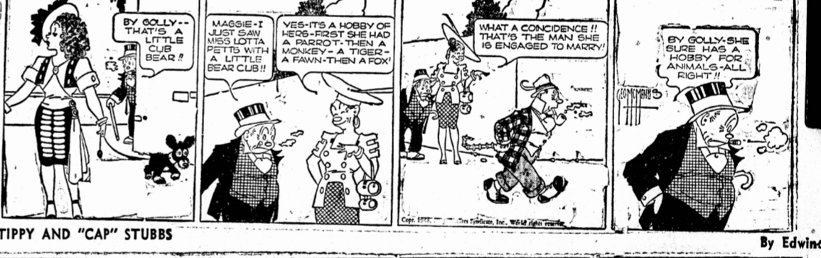
TIPPY AND "CAP" STUBBS