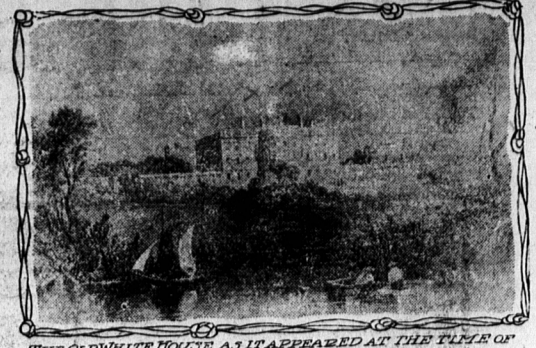
THE OLD WHITE HOUSE AS IT APPEARED AT THE TIME OF THE FIRST WHITE HOUSE WEDDING