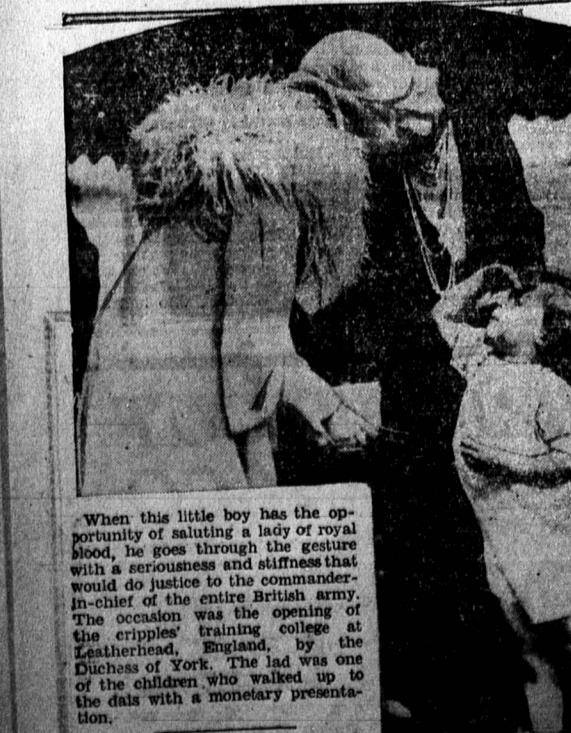
When this little boy has the opportunity of saluting a lady of royal blood, he goes through the gesture with a seriousness and stiffness that would do justice to the commander-in-chief of the entire British army. The occasion was the opening of the crippled training college at Leatherhead, England, by the Duchess of York. The lad was one of the children who walked up to the dais with a monetary presentation.

PEETERSFIELD, England, July 19.—Observing a servant girl with scaling a £50 ring police declared the inserted her own death notice in the papers after the alleged theft.