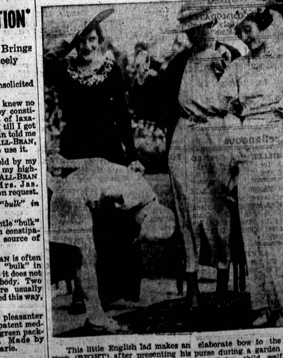
This little English lad makes an elaborate bow to the Duchess a York (RIGHT), after presenting his purse during a garden party at St. James' palace in aid of the national council for child welfare in England.