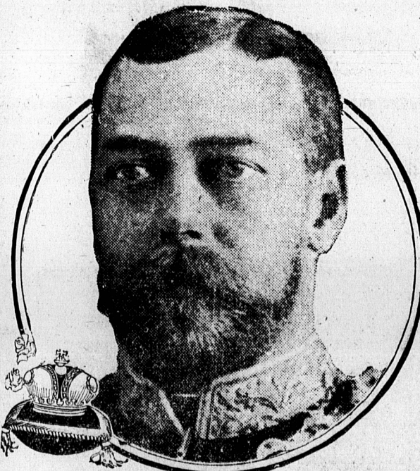
HIS MAJESTY KING GEORGE V Now Inspecting the Mammoth British Fleet at Weymouth.

ONTARIO THEATRES MUST BE LIGHT DURING A PERFORMANCE. TORONTO, May 10.—The danger to young girls that lurks in the dark theatres has impressed itself upon the provincial treasurer and the censor board, and hereafter no theater may be kept in darkness during a performance. The regulation requires that for every 350 square feet of floor space there shall be a two candle power white light around the walls. After the first of next month every moving picture theater must post up outside certificates endorsed by the chairman of the board of censors for each film shown. Films not properly approved may be confiscated.