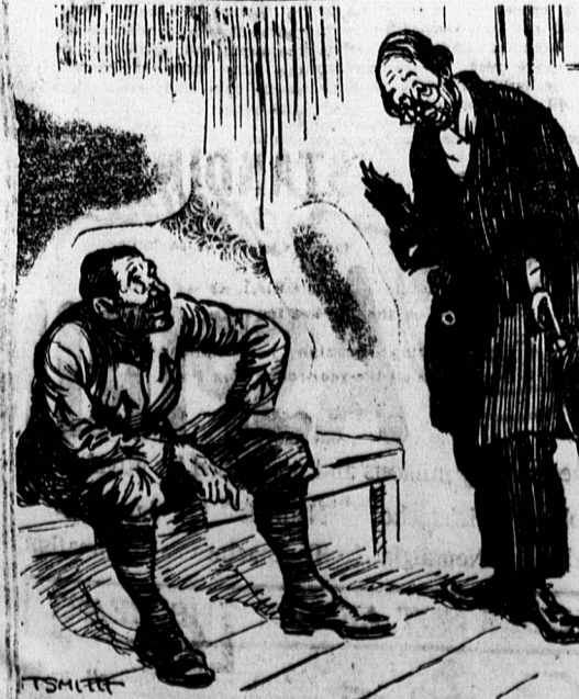
Victor: "Ah dear friend, thinking of your sad past?" Convoit: "No, I was wondering what paper I'd write my experiences from when I get home."

If a tile or two falls out of the bathroom wall, just coat the back with the best quality liquid glue. Press it in place, hold it until the glue hardens, and it will then be there for keeps.