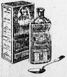
Remember this package. None genuine without the signature of Lydia E. Pinkham.

South Omaha, Nebraska: "After fifteen years of terrible suffering each month with sick headaches I began to take Lydia E. Pinkham's Vegetable Compound, and I have felt my health steadily improving."