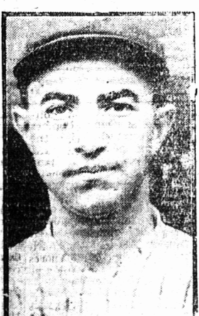
Jampin' Joe Dugan, crack third baseman of the Yankees who was listed among the famous "cripple" list. Dugan is the only ball player in the big leagues who can boast of trick knees—jumping out of place when taking grounders at difficult angles.