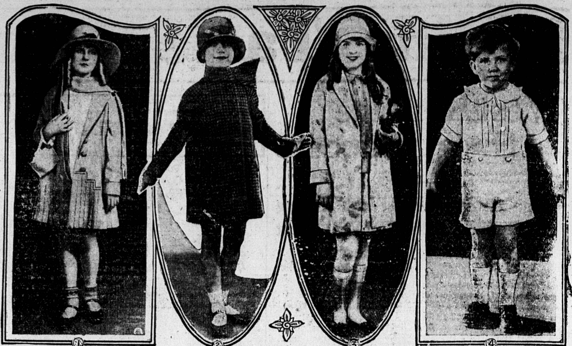
(1) A jade green kasha coat over a white silk frock, worn with a green hat. (2) This brown checked woolen coat, with a hat of tan straw and brown ribbon, is extremely smart for the little miss. (3) A kasha in pastel colors with pale tan overblouse. A natural straw hat completes the costume. (4) A smart Oliver Twist suit for the boy between four and eight. There are linen trousers with an artist blouse.

There have been so many letters about face peeling lately that I feel I must say a few words about it in this column. I do not like to include this subject in a series of talks on health and beauty because skin peeling is seldom, if ever, justifiable in my opinion, and is fraught with danger both to health and good looks. This is especially true when the peeling is done at home without expert medical advice.