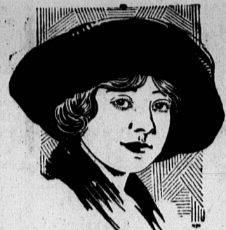
LILA LEE in "Such a Little Pirate"

You remember when you were young. How you used to read those old Pirate stories. Be young again. See "Such a Little Pirate" It's not one of the blood thirsty stories, but a treat for old and young.