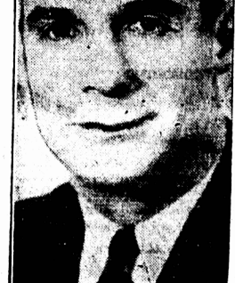
Lionel Conacher, former N. R. L. star, has entered the federal political arena on the Liberal ticket in the Ontario riding of Trinity. Two other stars of Canada's national game who are running are "Bucko" McDonald and "Dit" Clapper.

The 3,000-word platform outlined the Liberal record since 1933 and a detailed program of what the government proposed if re-elected.