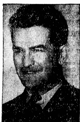
WING COMMANDER J. ANGUS MacLEAN, D. F. C. Candidate for Queen's County

The Mackenzie King Government is appealing to the electors for the endorsement of its war record. Let me emphasize then that Canada's war record — military and civilian — is not a Government record. It is the record of the people of Canada, irrespective of party and creed, and it is a tribute to the Canadian people alone. The war record of the present administration, from the beginning, is one of instability, evasion and indecision. Were it not for the continual prodding, leadership and co-operation of the Progressive Conservative Party, Canada's war effort would indeed have been a shameful one.