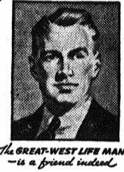
THE GREAT-WEST LIFE MAN is a friend indeed

What do you want most for yourself or your family—protection, an education, a retirement fund, continuance of your salary for your family when you are gone? Get in touch with the nearest Great-West Life office or representative. Discuss your aims with a Great-West Life man.