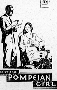
ANOTHER POMPEIAN GIRL

AFTERNOON TEA , people Dick had never seen before, and then—the one girl, the girl of his dreams! They met, she smiled at him—feminine—glamorous—wholly desirable. That was the beginning—Tam's secret is simple—she was another Pompeian Girl. It is your right—your privilege to make yourself as desirable as Tam. For years beauty specialists have been perfecting Pompeian products—until today, while it is possible to pay more, it is impossible to buy better. Pompeian Beauty Powder adds enchantment to the loveliest of women. It comes in five shades—one especially suited to your coloring, and it can now be obtained in cake form in an exquisite new Compact. Indelible Lipstick 60c.—Night Cream (Cleansing Cold Cream) 60c.—Day Cream (Vanishing) 60c.—Massage Cream 60c.—Powder Compact 60c.—Talc 25c.—Beauty Powder 60c.—Bloom 60c. Send 10c. (coin) to Dept. 17, The Pompeian Co., Ltd., 295 Richmond St. W., Toronto, Ont. for new Art Panel, a copy of our booklet "Your Type of Beauty" and samples of Pompeian Day and Night Creams.