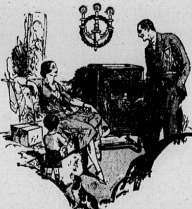
THE GIFT THAT KEEPS ON GIVING "THE NEW VICTOR RADIO"

Give Mother an Enterprise Range then you can say—"I have chosen well." Such a gift, well chosen, is a gift well received. Long after the holidays are past an Enterprise Range will continue to lighten her daily work, providing a constant source of delight. An enduring reminder of the giver.