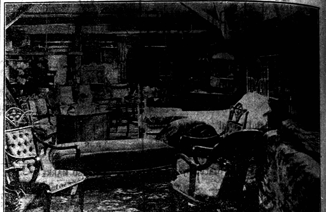
ANOTHER CORNER OF THEIR HOUSEFURNISHING DEPARTMENT.