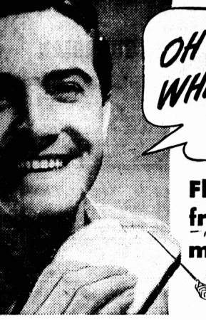
OH BOY, WHAT GRAND BREAD!

GLOUCESTER, England, June 20 — (CP) — A Judge at the Gloucester assizes suggested that undivided divorces be handled through the Post Office, sparing the time of legal authorities already fully occupied with defended cases, he said. "I could be dealt with by someone with less intelligence than His Majesty's justices are supposed to possess." "Why, even I have sufficient intelligence to deal with these cases at an average of 4-2 minutes each."