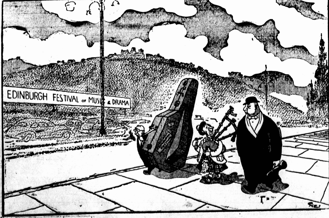
"Never heard Bach on the bagpipes before?"