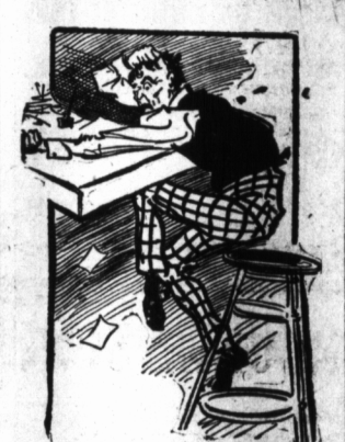
There is No Greater Torture Than Piles.

There is no greater suffering than this if you are a sufferer from piles you know it. It is foolish to think that any amount of cathartics will relieve you. On the contrary purgatives are favorable to the production of hemorrhoids. Do not be deceived either by the illusion that an operation always cures. It sometimes does, but the