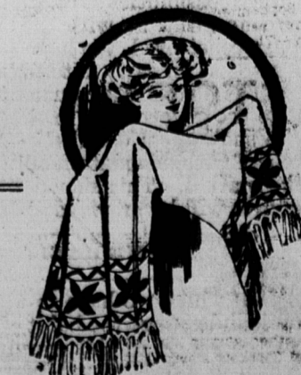
Table Linen all Kinds at 15 p.c. off