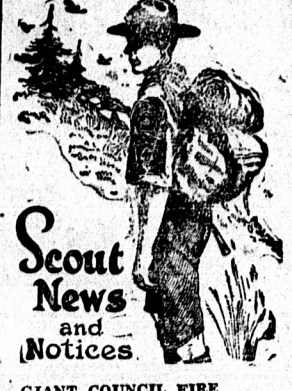
Scout News and Notices GIANT COUNCIL FIRE

Regular meetings of the First Charlottetown Troop have been discontinued and the Scouts are now working on a summer programme.