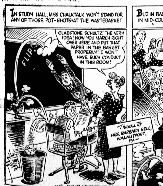
IN STUDY HALL, MISS CHALKTALK WON'T STAND FOR ANY OF THOSE POT-SHOTS AT THE WASTEBASKET