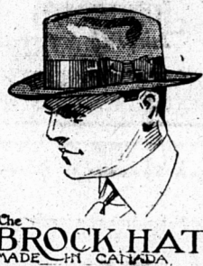
THE BROCK HAT MADE IN CANADA

Prowse's specialize in Men's hats at this price--blocks for all types of men in shades of brown, green, slate and black, all sizes--the best value in Canada--