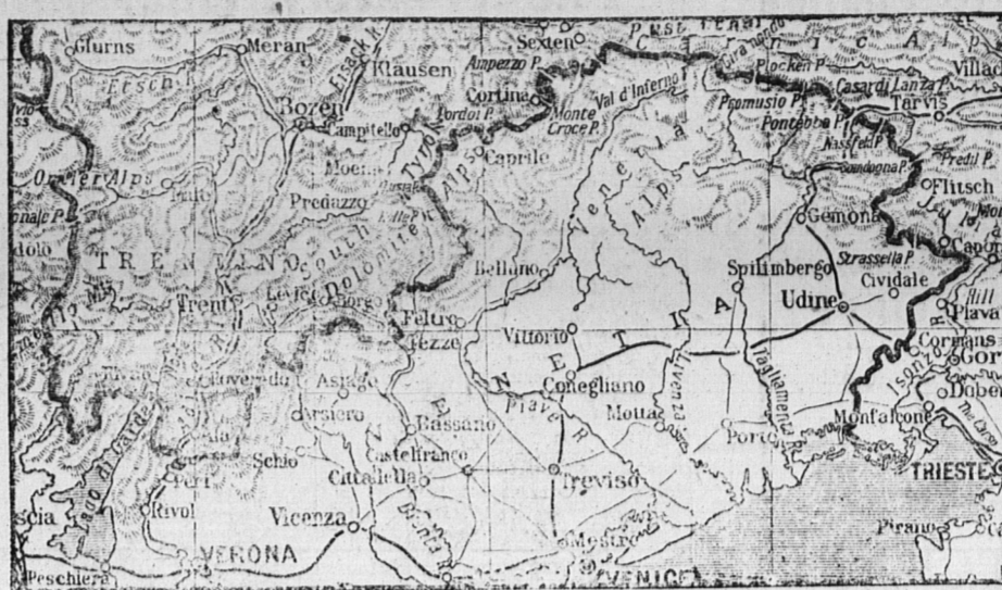
MAP OF THE ITALIAN-AUSTRIAN BATTLE LINE.