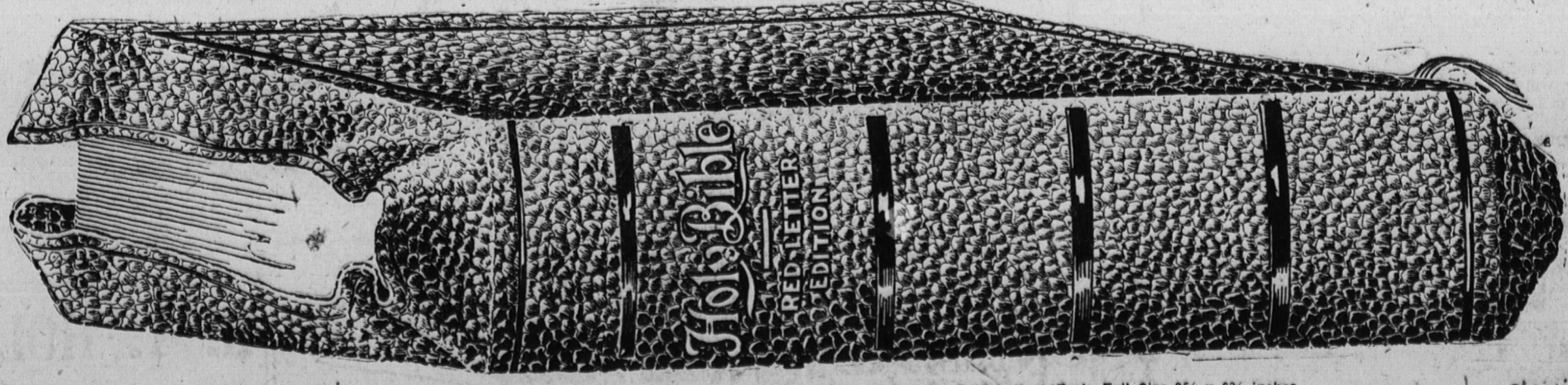
Specially Bound in Genuine Limp Bible Leather, Folding Cover, Red Edges, Round Corners, Gold Lettered Back, Full Size 9 1/2 x 6 3/4 inches.

has the unqualified approval of the Bishop of Charlottetown, Cardinal Gibbons of Baltimore, Cardinal Farley of New York, and Cardinal O'Connell of Boston.