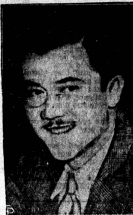
Leslie Charteris, of England successor to Edgar Wallace, late writer of best-seller detective stories, is shown in his New York hotel suite. He is the creator of "Alias the Saint", a character that appears in 20 books. He is in U. S. specifically to study crime.