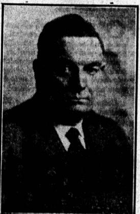
HON. G. SHELTON SHARP Minister of Agriculture