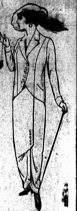
This Style $20.00

A Tailored Suit A smart tailored suit in black and navy, mannish serge suit effect. Coat is silk lined, skirts slightly slashed, button trimmed showing the very latest ideas in tailor made suits, (see cut). Splendid value at $20.00