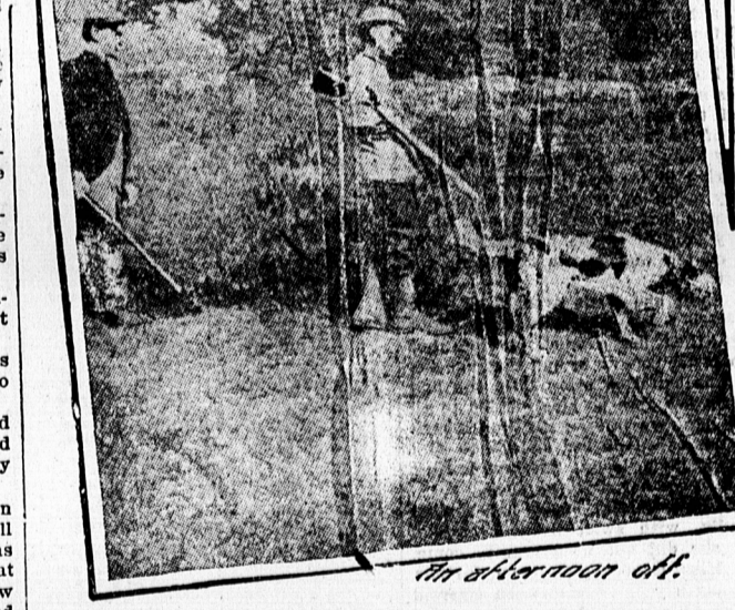
Duchess of Hamilton.