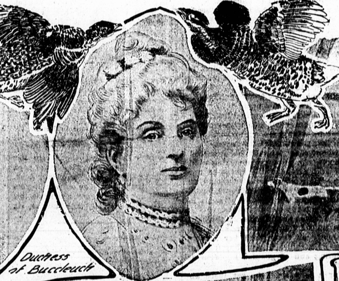
Duchess of Buccleuch.