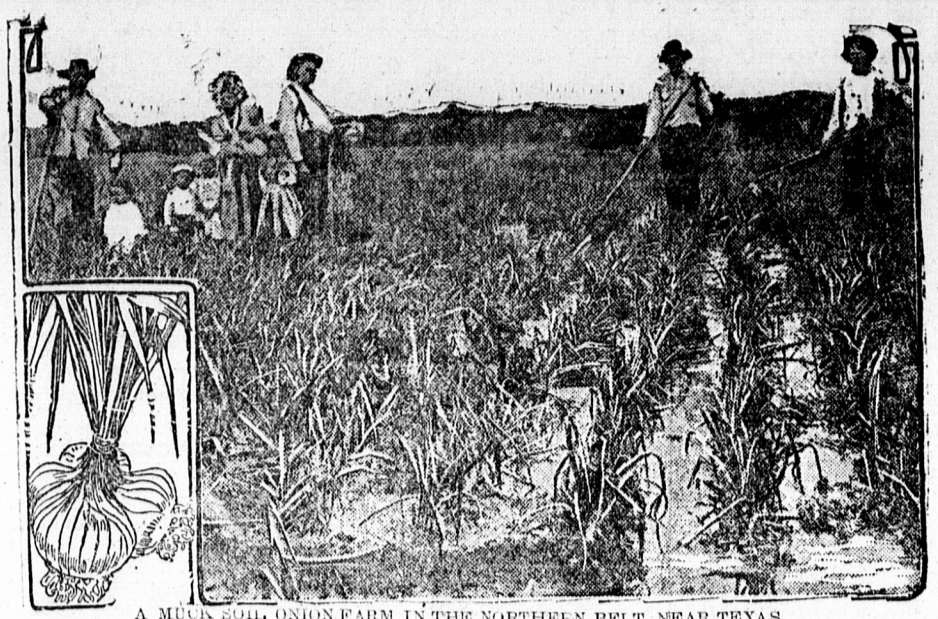
A MUCK SOIL ONION FARM IN THE NORTHERN BELT, NEAR TEXAS.

20c A MONTH BY MAIL IN ADVANCE $2.00 PER YEAR BY MAIL IN ADVANCE