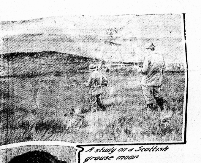
A study on a Scottish grouse moor.

The Canadian paper and pulp interests retort that the pledge specially related to stumpage taxes, not to exportation and that the extension of that privilege to American owners for another year will retard Canadian plans and discriminate against Canadian manufacturers, who now suffer because of the retaliatory clauses of the United States tariff on print paper. The provincial authorities are balancing the question whether they should prohibit the exportation of pulp wood on January 1, 1910, or September 1, 1910. They calculate that the new policy will add over $200,000 per annum in revenue. They are informed that the interests controlling the Berlin mills property in New Hampshire are planning to install a print paper plant at La Tuque, and that the International Paper Company has prepared plans for numerous locations for paper mills in Canada, that company having stopped the manufacturer of print paper at a number of its mills in the United States.