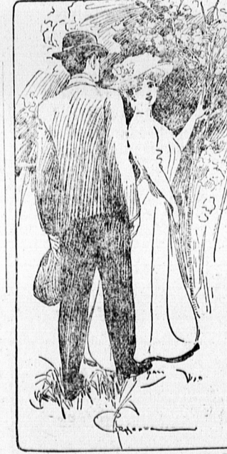
SLOWLY HE FOLLOWED ALICE ALONG THE PATH.

He did not go near his wife, but late in the afternoon his mother persuaded