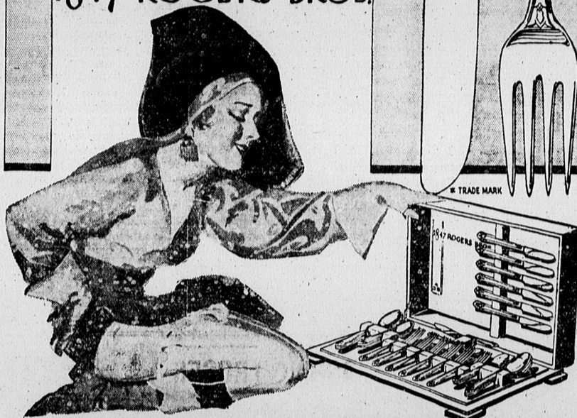
When buying Silverware—Insist upon products of the U.S. International Silver Co.