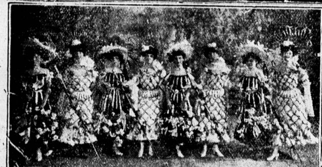
THE "DAISY" DANCING GIRLS WITH ROBINSON OPERA CO NEXT WEEK.