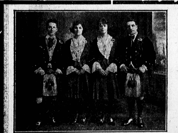
The Scotch Quartet