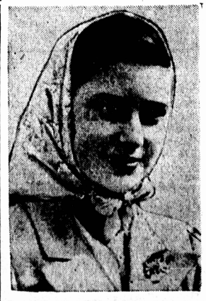
PRINCESS MARGARET ILL, BUT CARRYING ON Princess Margaret Rose was ill after an overnight trip to Scotland. Glasgow reports. She did, however, make a speech and accept the freedom of the city of Glasgow on behalf of the Highland Light Infantry, of which she is colonel. The nature of the illness was not disclosed. Part of the activities planned for her while she was in Scotland had to be cancelled.