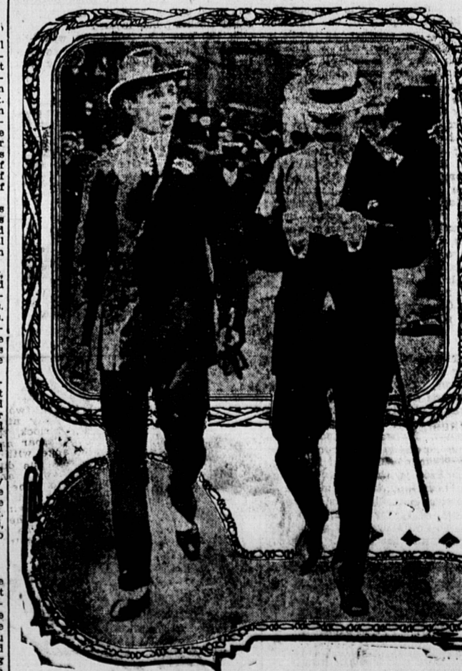
The King Alfonso of Spain, is doing some strenuous sightseeing in London. The picture is from a snapshot of him taken just as he was starting out for a day's excursions.

Exact Reproduction of the Great Church in the Square of St. Marks